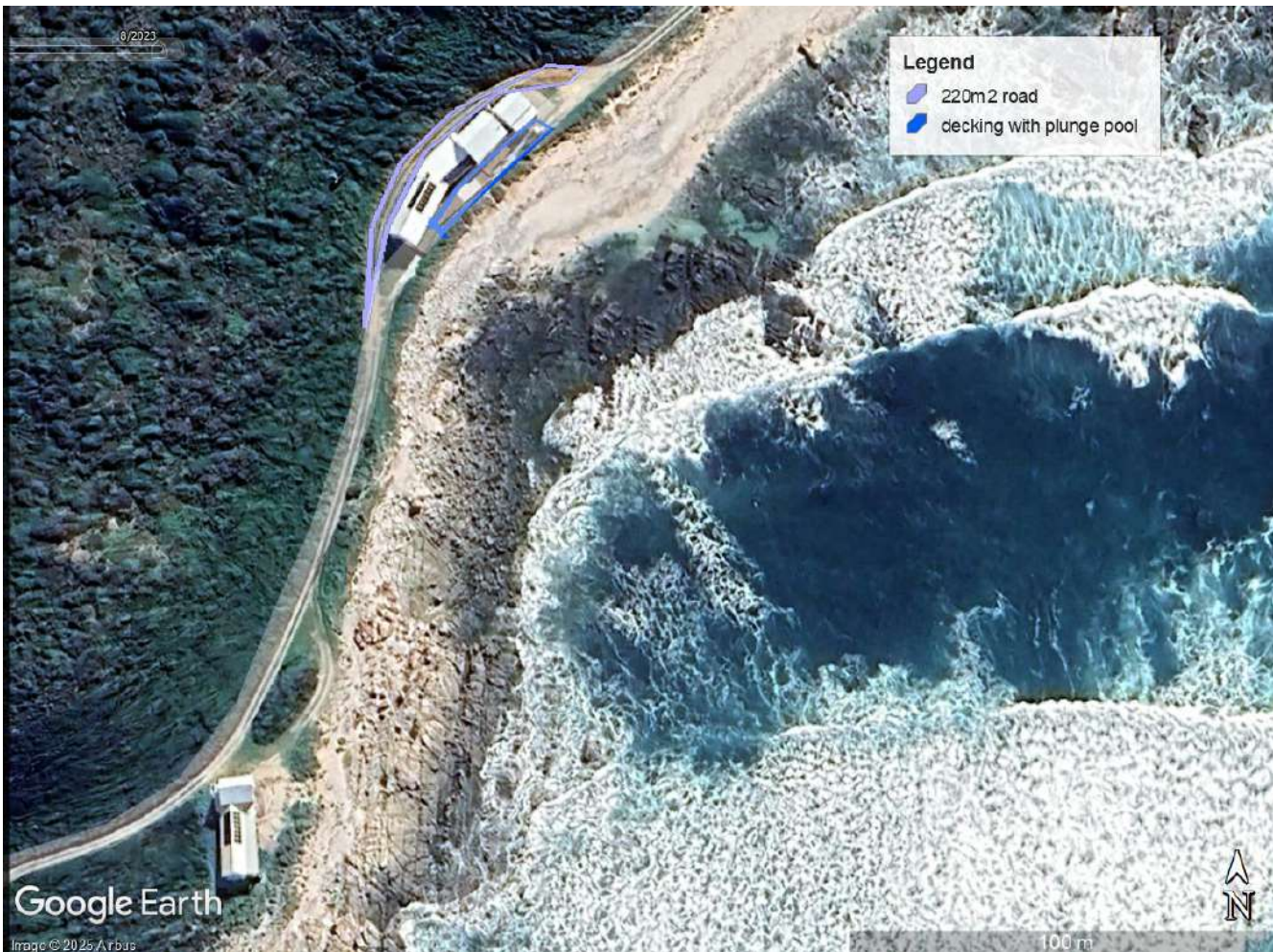
Figure 2: Activities carried out within 100 m of HWM; NE dwelling is rented to holiday makers; maximum 12 guest permitted; SW dwelling is used for private residential / holiday purposes.