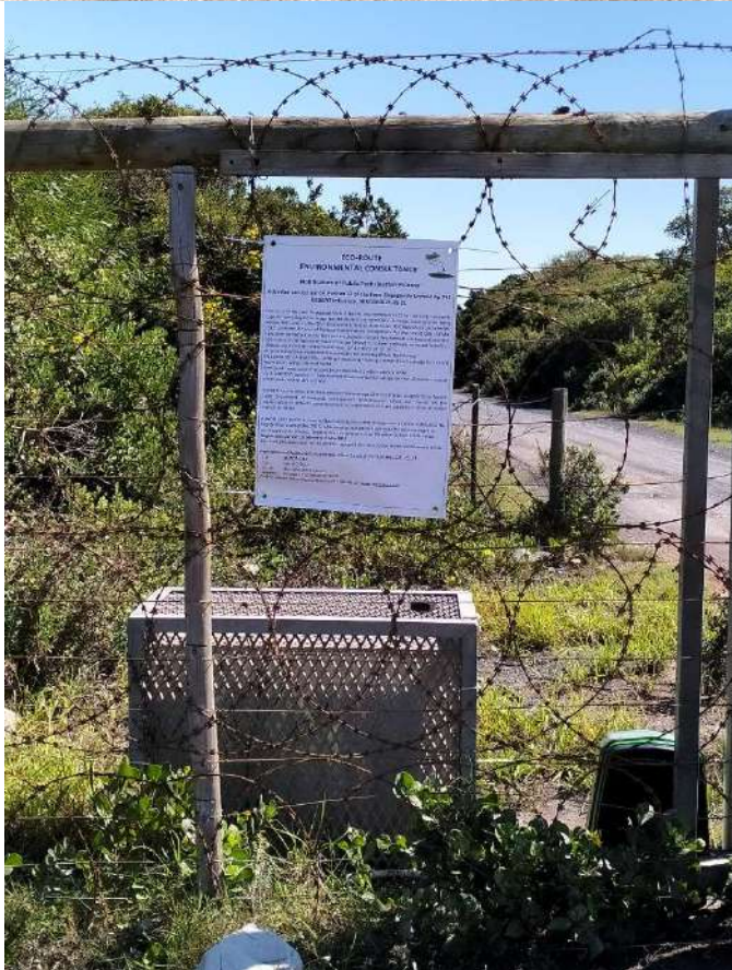
Two site notices were placed at the main access to the site.