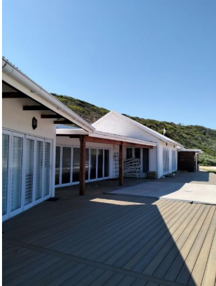
Front of main cottage showing raised decking over old access track facing east