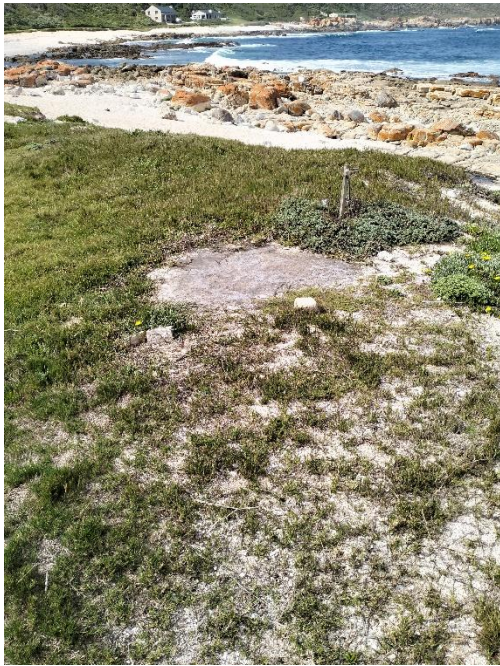
Facing south of main cottage showing rocky seashore