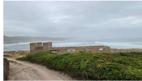
Photographs showing construction of second dwelling in progress