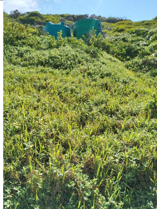
Facing north of main cottage showing intact vegetation