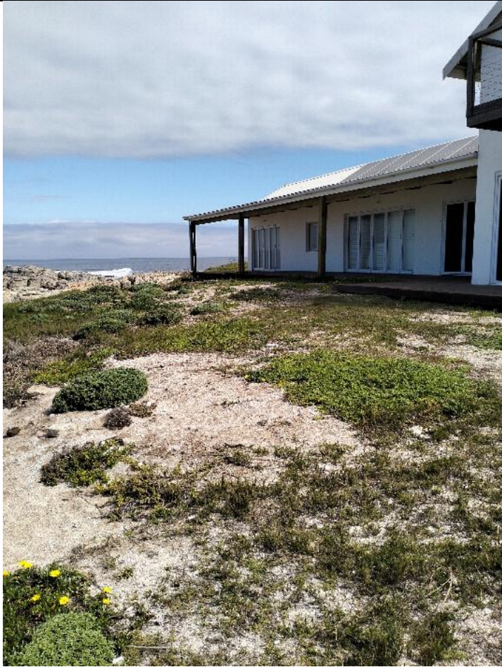
Second cottage developed mostly on footprint of the previous dwelling