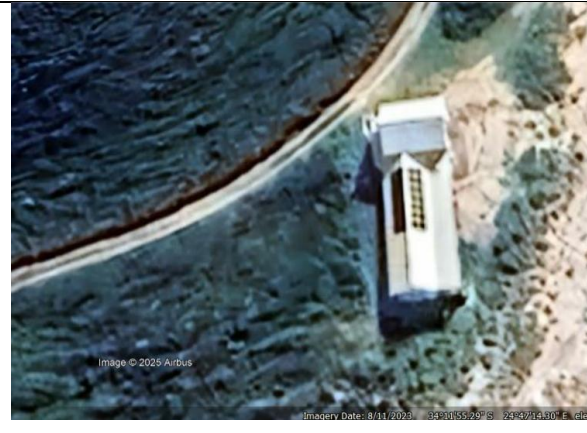
Imagery showing second dwelling prior to renovation post to renovation with indication of footprint