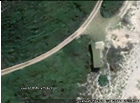
Imagery showing second dwelling prior to renovation with indication of footprint