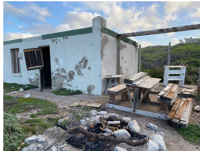
Second dwelling prior to renovation showing approximate footprint