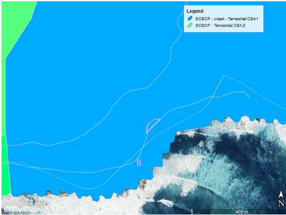
Figure 5: Site falls within terrestrial CBA 1 (ECBCP, 2019)