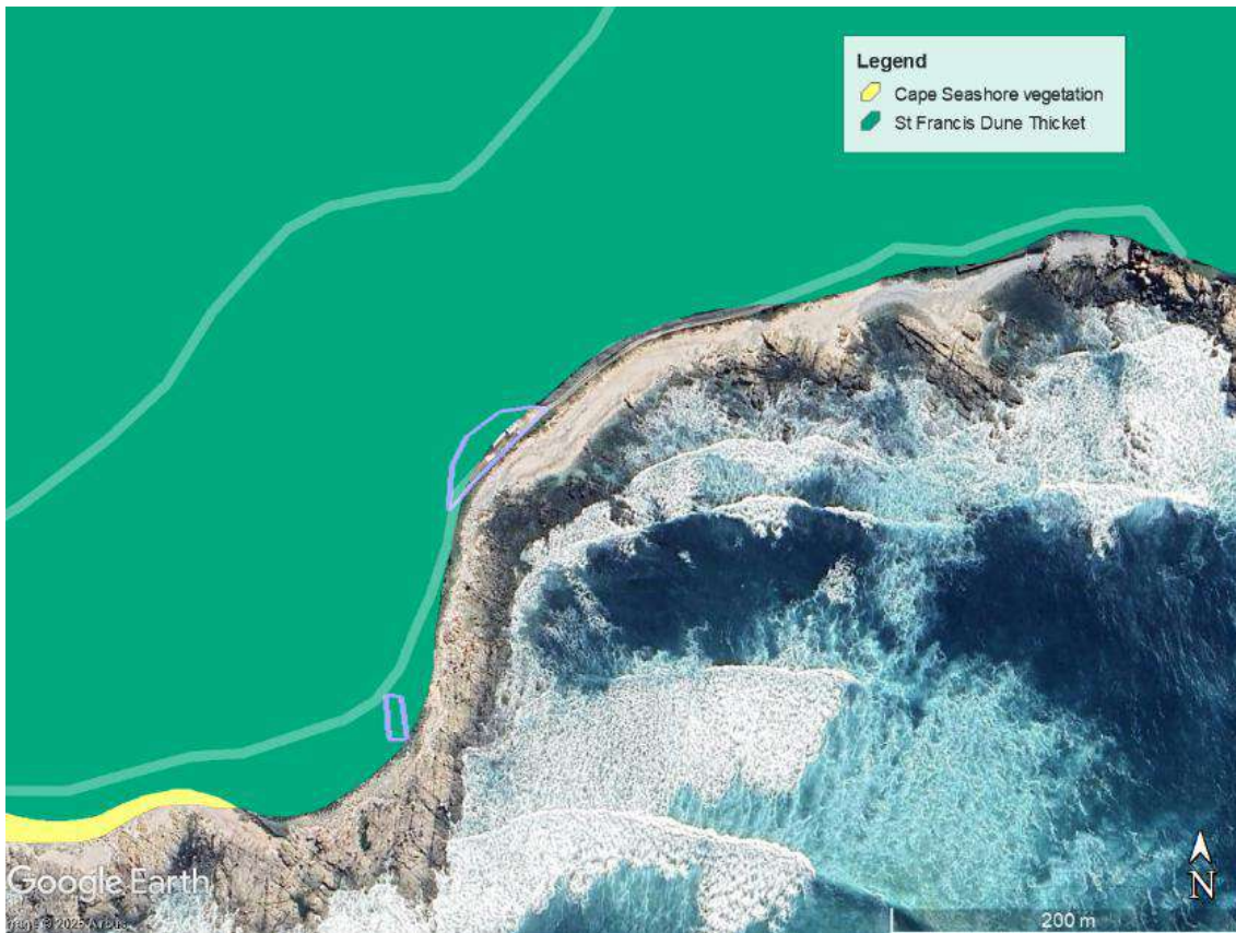
Figure 3: Vegetation types in terms of NatVEG Map, 2019