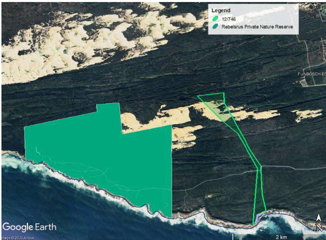
Figure 4: Site located within 5km of Rebelsrus Private Nature Reserve