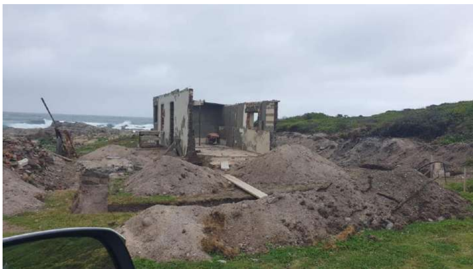
1 New foundations outside the perimeter of the old structure (south western building)