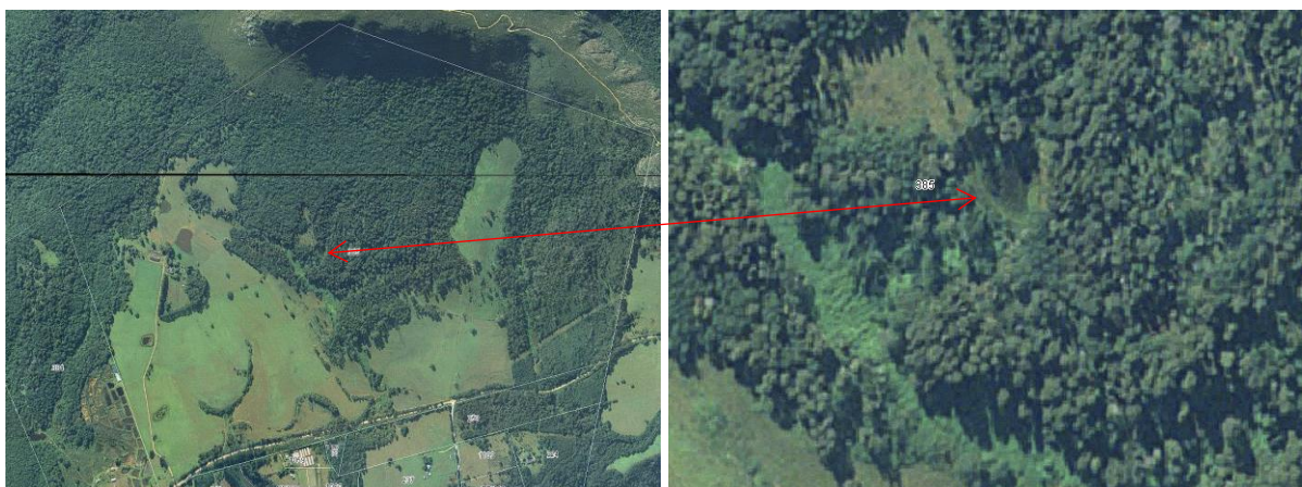
Figure 3: Orthophoto from 2000 indicating presence of dam.