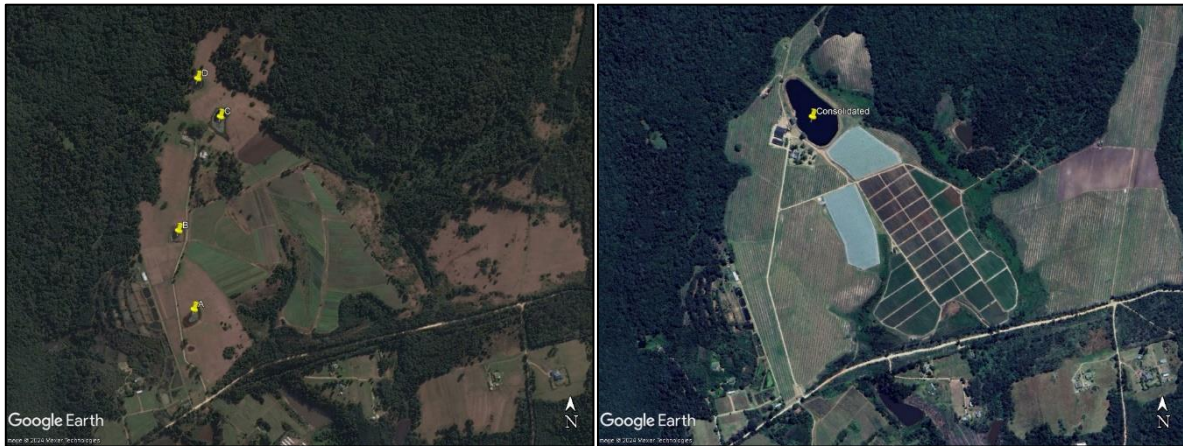
Figure 1: Satellite images showing location of 4 smaller dams which were consolidated into 1 single dam with a storage volume 47 233 m 3