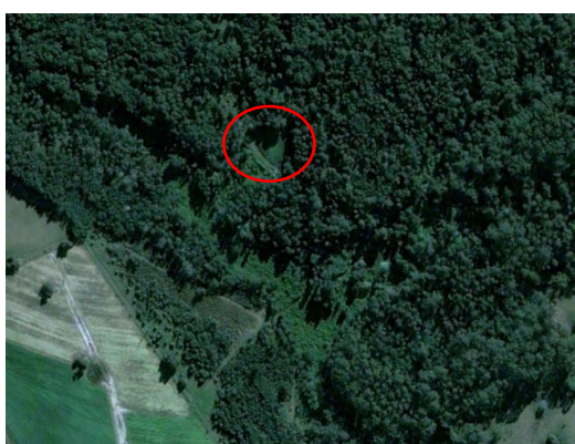
Figure 4: Google Earth satellite image from 2006 indicating presence of dam.