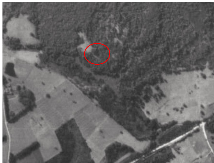
Figure 2: Orthophoto from 1991 indicating presence of dam.