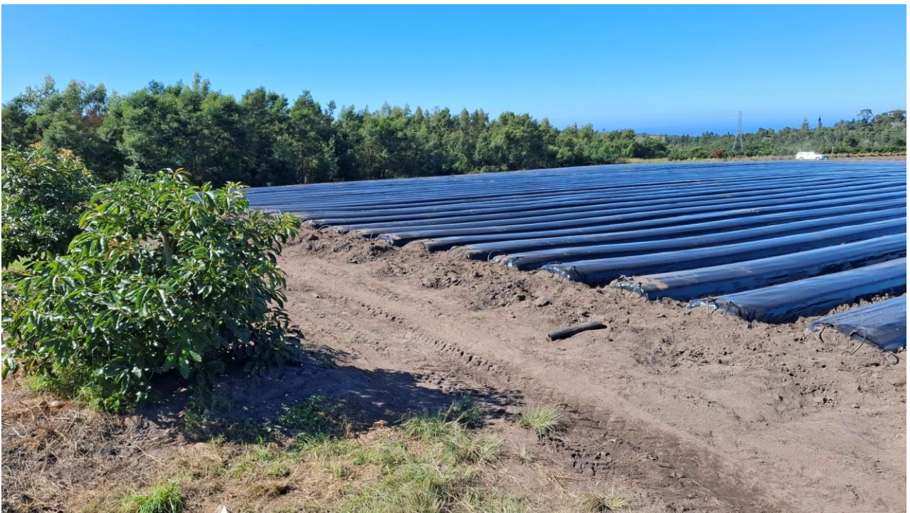
Figure 5. Recently established cultivation lands adjacent to the assessed site. The assessed site is within the forested vegetation in the background.