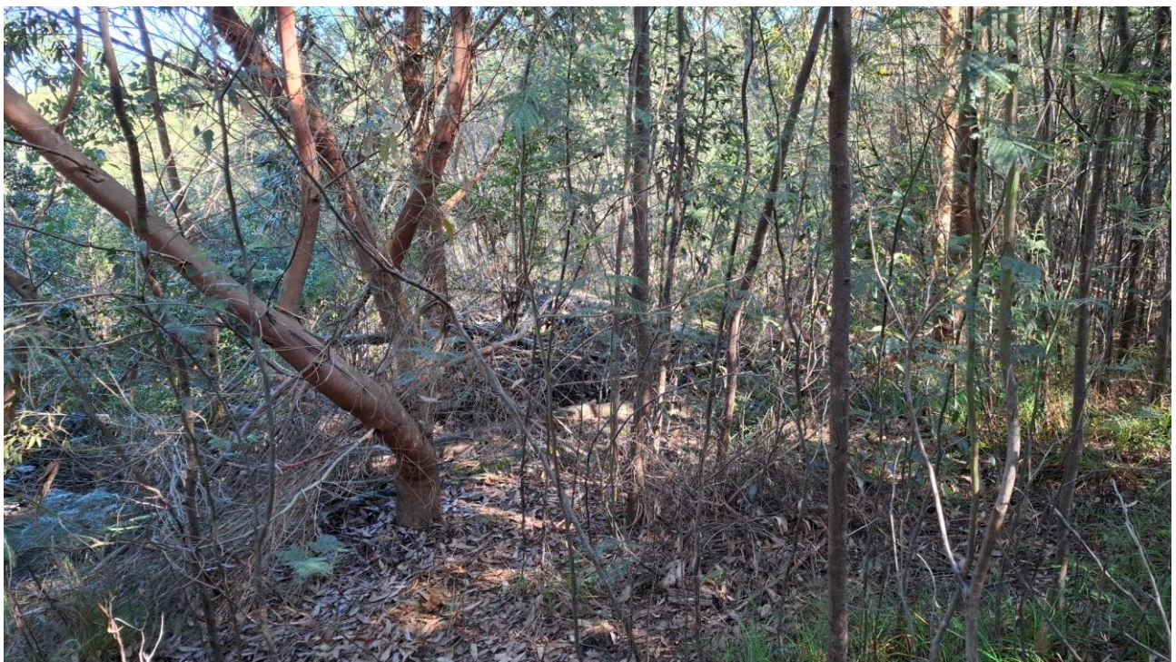
Figure 3. Typical site conditions showing the thick, largely alien vegetation.