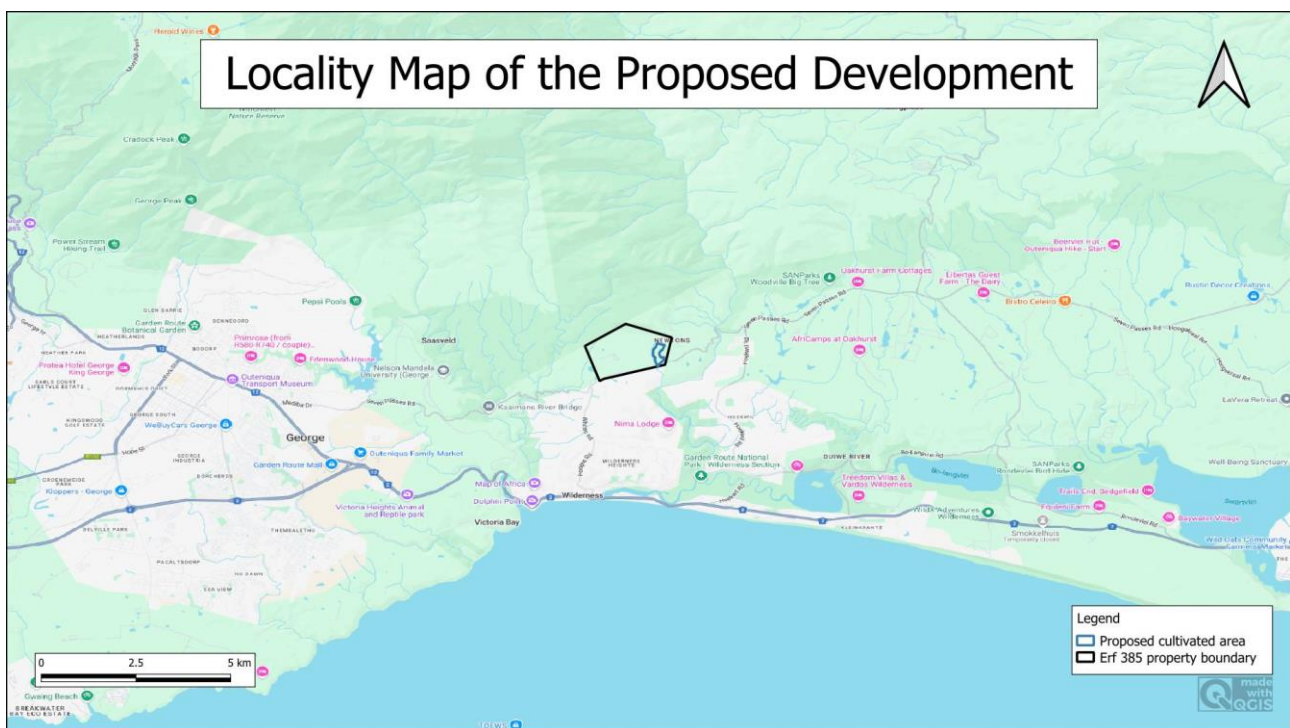
Figure 1. Locality map of the proposed development, northeast of Wilderness.

In this case, the development will enhance agricultural production potential and therefore has a positive agricultural impact. A normal assessment of the impact is not important in such a case. What is required instead is to confirm whether the site is viable or not for cropland, and that the soil resources on the site will not be damaged by the proposed activity. The appropriate level of agricultural assessment in such a case is an Agricultural Compliance Statement.