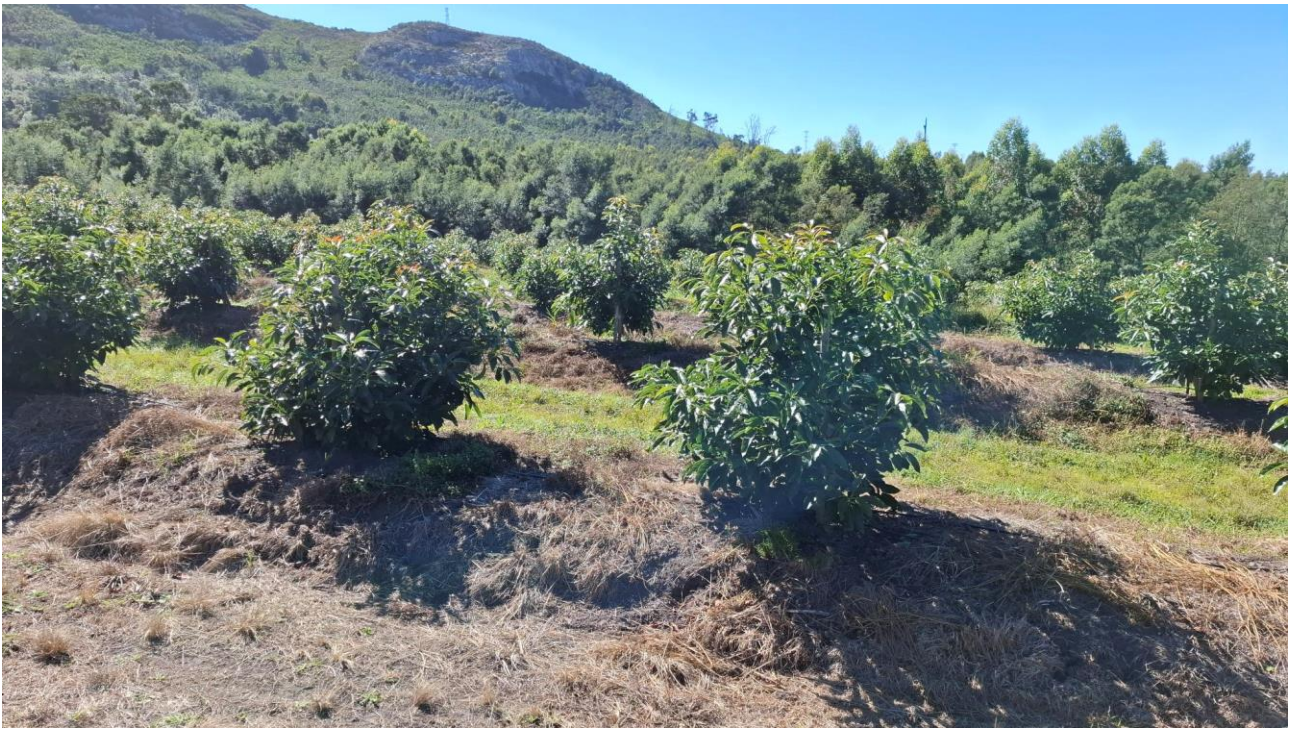
Figure 4. Recently established avocado orchards adjacent to the assessed site. The assessed site is within the forested vegetation in the background.