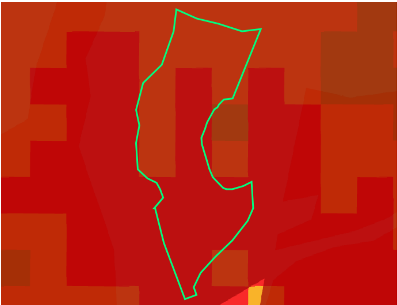
Figure 6. The assessed area overlaid on agricultural sensitivity, as classified by the screening tool (green = low; yellow = medium; red = high; dark red = very high).

The agricultural sensitivity of the site, as classified by the screening tool, is shown in Figure 6 . The screening tool classifies the assessed site as being entirely very high agricultural sensitivity because of its PAA status. It is also high sensitivity due to its land capability rating of 8 and 9. As has been shown in Section 7, the site is suitable for irrigated crop production and is therefore verified as high sensitivity. There is not yet any irrigation established on the site, and it is therefore verified by this assessment as high sensitivity rather than very high sensitivity.