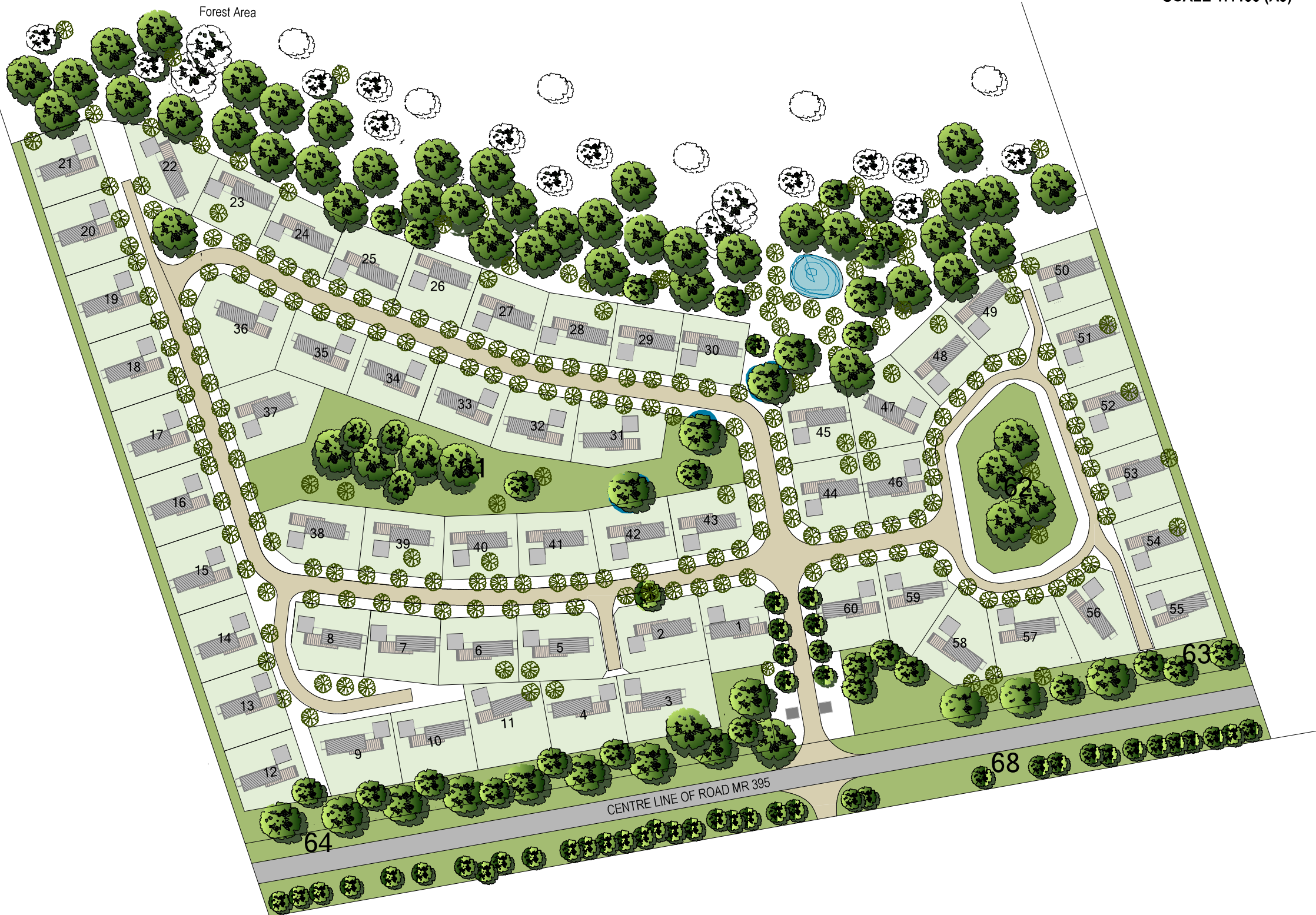
DIAGRAM 8 - LAYOUT 3