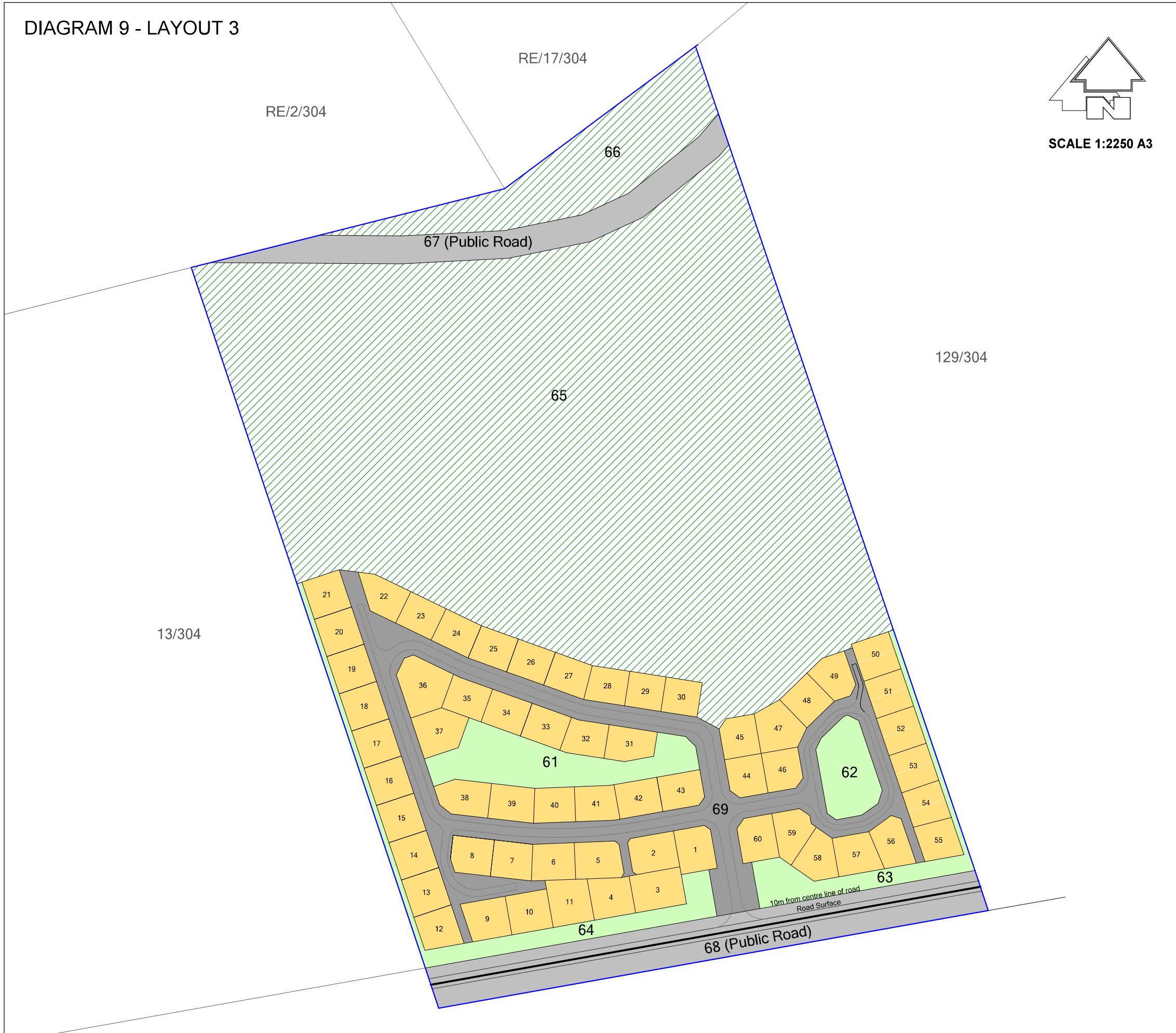
DIAGRAM 9 - LAYOUT 3