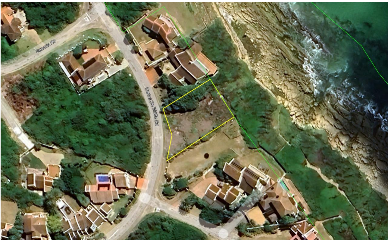
Figure 1: Site locality & Aerial Photo.

The site (Erf 1216) is situated in St Francis Bay, Kouga Municipality, Eastern Cape province with an area of approximately 730m 2 . The site is located on the seaward edge of an urban area, with the sea on the eastern side and developed erven on the north and south sides. The western side is bounded by a surfaced (tarred) road (Carlos De Wolfe Rd) on the western side, with undeveloped and developed erven on the opposite side of the road.