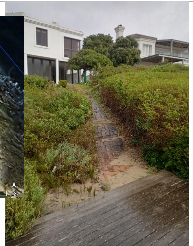
Figure 11: Photo taken from beyond eastern boundary of erf from deck in the east showing steep gradient and rocky coastal area