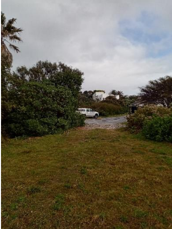
Figure 1: Western section of erf showing existing gate / access / area of new gate

Proposed expansion of development footprint on Erf 1220 located within 100 meters of the high-water mark of the sea St Francis Bay, Kouga Local Municipality, Eastern Cape