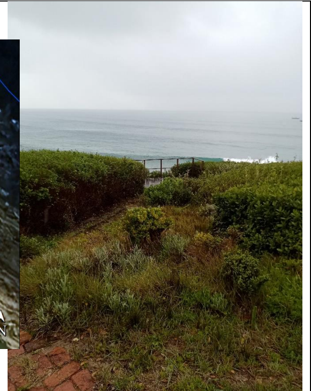
Figure 9: Photo taken from beyond eastern boundary of erf showing footpath to the south east