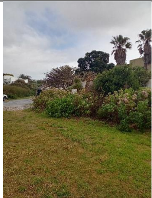
Figure 3: NW section of erf showing proposed area of garage