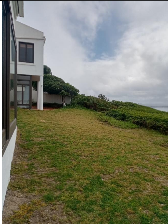
Figure 7: Eastern section of house showing proposed pool and decking areas (top)/ northern corner of proposed decking area