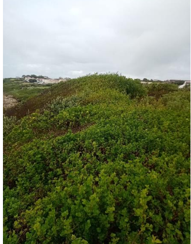
Figure 13: Adjacent intact vegetation (thicket) on coastal dune area, east of the house