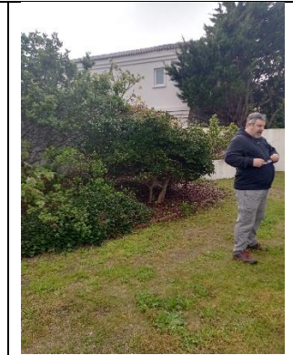
Figure 4: Northern section of erf showing proposed area of home extension