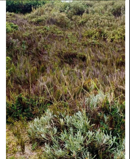
Figure 14: Adjacent intact vegetation (some fynbos species) on coastal dune area, east of the house