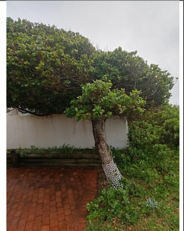
Figure 8: Northern corner of proposed decking area (Milkwood tree incorporated into design and will not be disturbed)