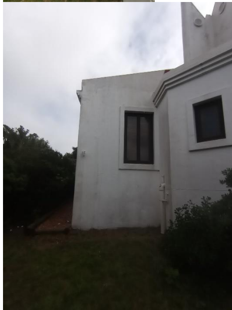
Figure 5: Southern section of erf