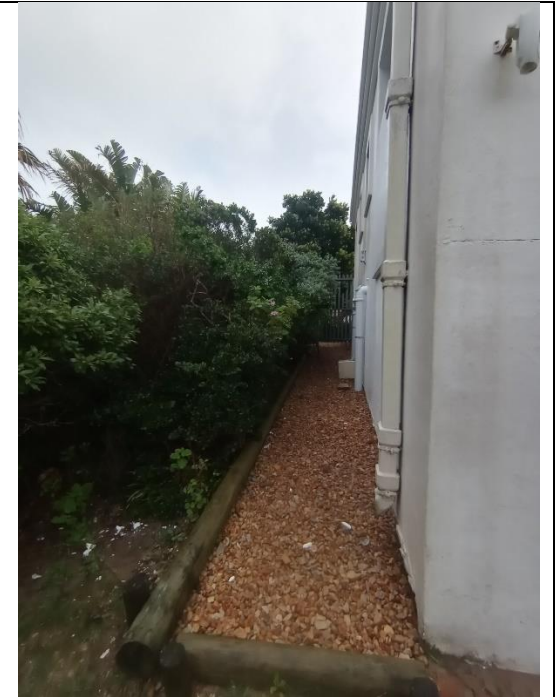
Figure 6: South western section of erf