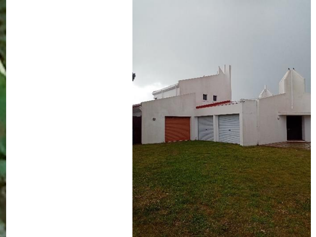
Figure 2: Western section of erf showing existing garages and front entrance