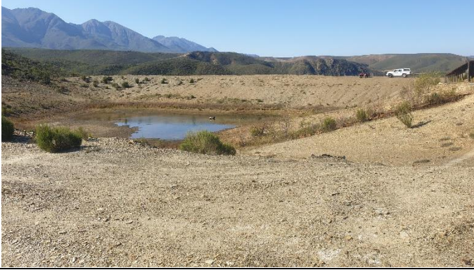
4. View across dam from west to east.