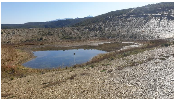
2. View across dam from east to west.