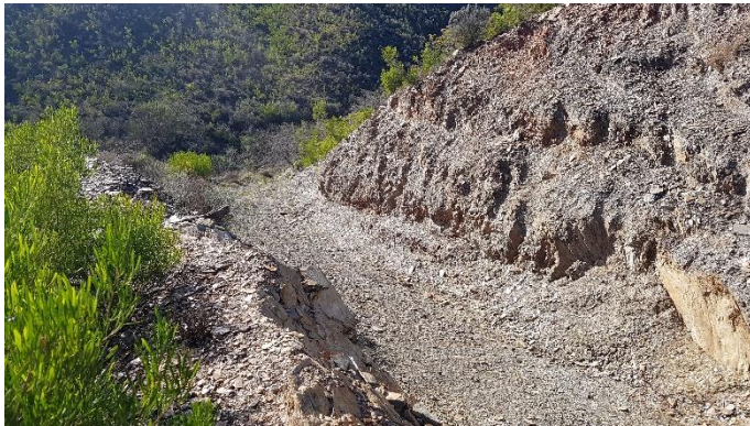
7. Dam slipway draining to wetland.