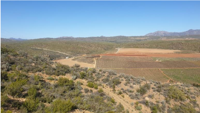
8. Surrounding vegetation and cultivated land.