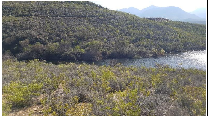
10. View of the western tributary into Groot Dam.