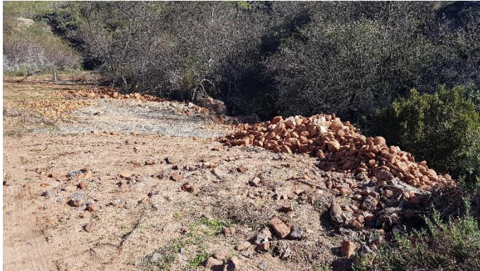
15. Discarded rock in small stream next to the dam wall.