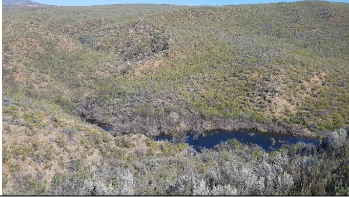
13. View of the eastern tributary into Groot Dam.