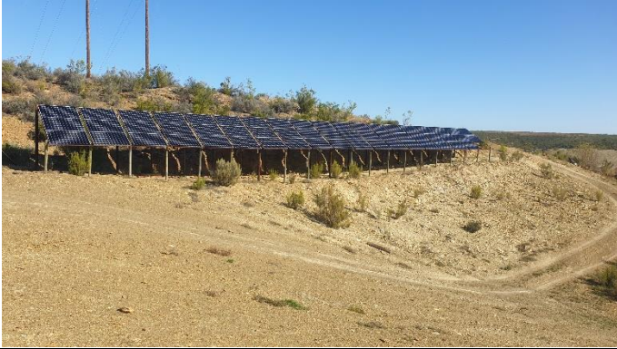
6. Solar panels on southern bank used to operate water pump.