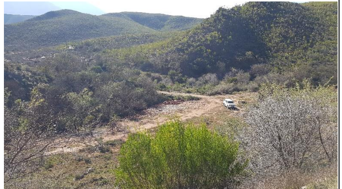
8. Access road to dam wall.