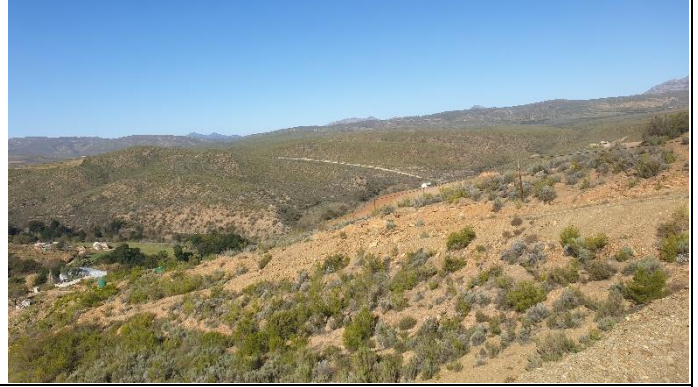
5. Pipeline for gravity feed.