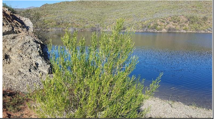
6. South view across dam from dam wall.