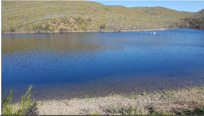
5. Southwest view across dam from dam wall.