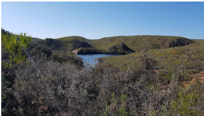
9. View across dam from western bank.