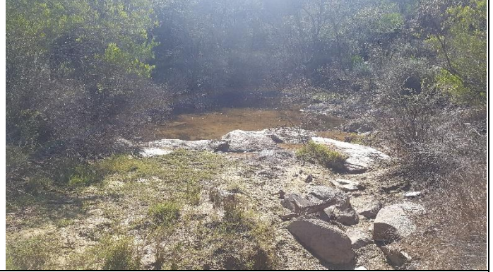
14. View from in the eastern tributary.