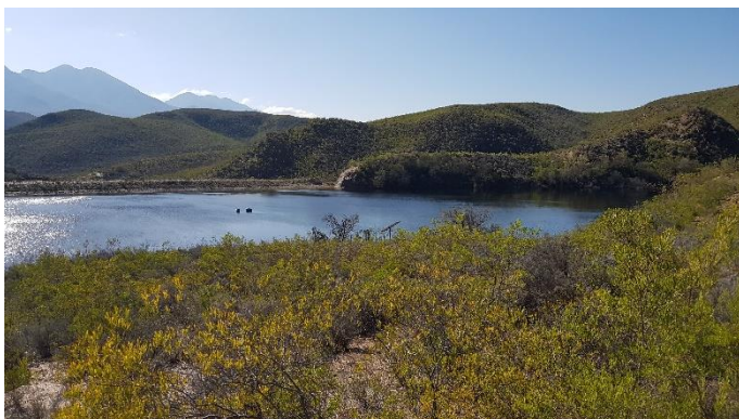
11. View across dam from southern bank.