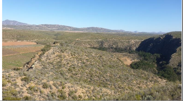
7. View of the Kammanassierivier from Kop Dam.