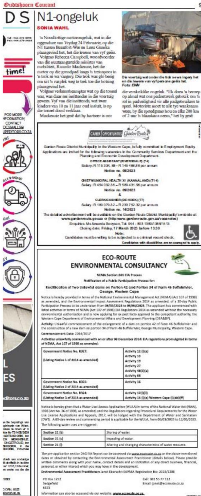
Figure 1: Advert placed in the Oudtshoorn Courant on 06 March 2022.