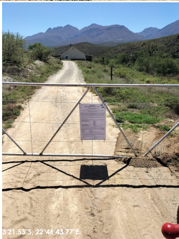
Figure 2: Two site signs were erected at the entrance to the properties.