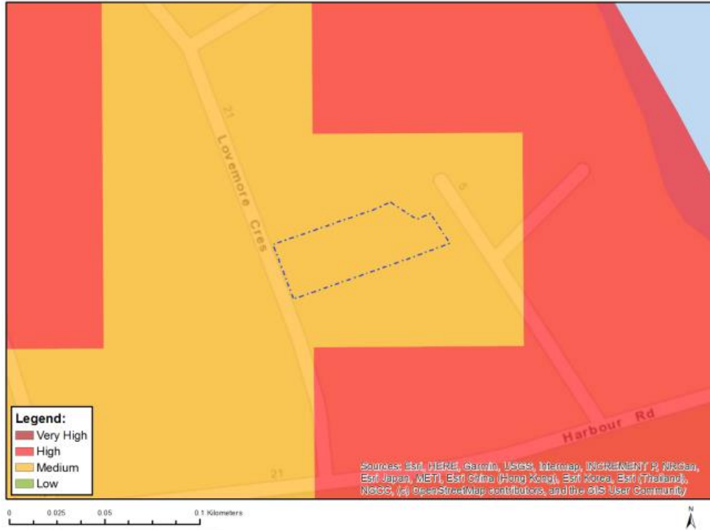
Figure 1: DFFE Screening Tool outcome for agricultural theme (medium sensitivity)

The DFFE Screening Report referred to in Regulation 16(1)(v) of the NEMA EIA 2014 regulations and generated using the DFFE Screening Tool, indicates that the site contains agricultural areas of medium sensitivity (Figure 1). A site assessment was carried out by an agricultural practitioner to verify the sensitivity of the site with regards to agricultural potential.