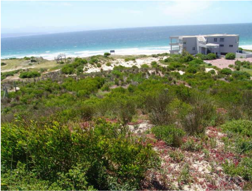
Photo 1: Disturbed vegetation in the vicinity of the existing infrastructure on the eastern side of the properties.