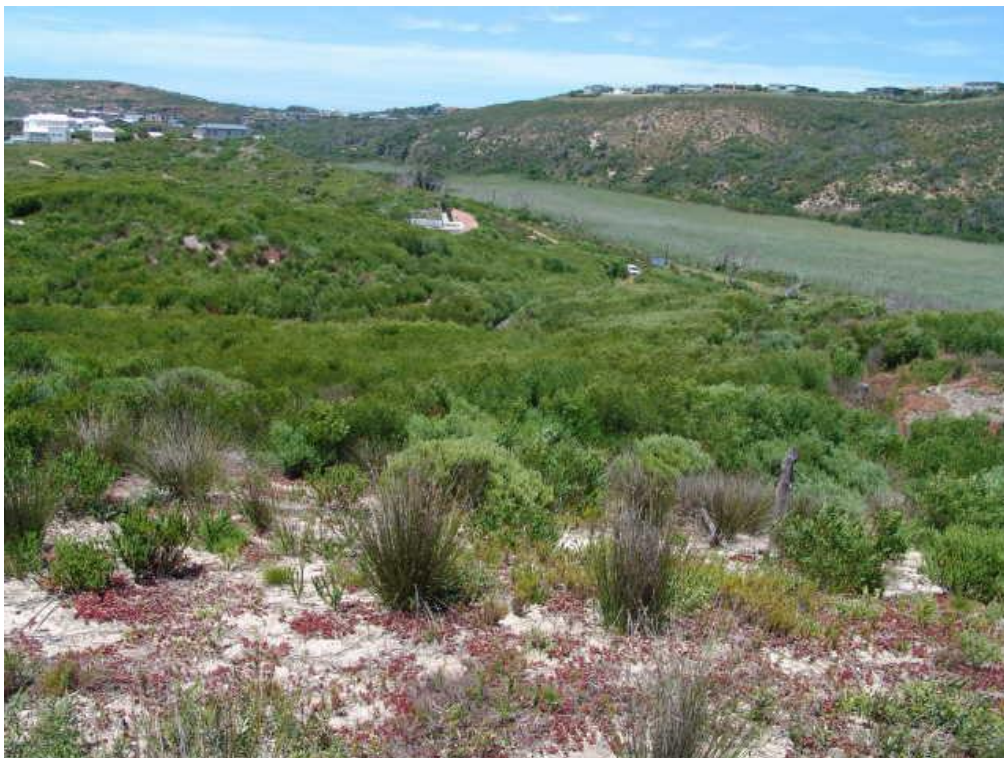
Photo 2: Dense regrowth of alien vegetation ( Acacia cyclops ) on the western part of the properties. Very few indigenous species were found in this dense stand of alien plants as it is the second rotation of dense infestation.