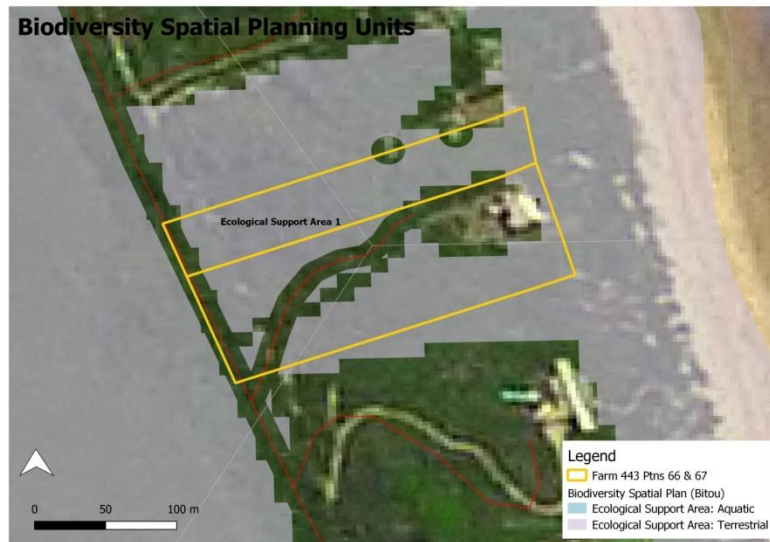
Map 3: Regional conservation plan for the affected area (from Pence; 2017).

The vegetation on the property is not in a healthy ecological condition and the field study (complete species inventory) showed that the plant species richness is poor. The construction of the current infrastructure disturbed a major part of the affected area (See Photo 1). There is clear evidence that a major effort was made to combat alien plant species (mostly Acacia cyclops ), but these plants returned in very dense stands over most of the property after the recent fire (See Photo 2).