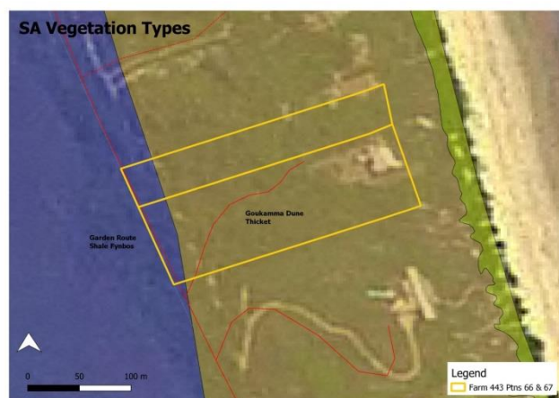
Map 2: National vegetation types (2018) on the property.

About half the extent of the properties was mapped as terrestrial Ecological Support Area in the 2017 regional conservation plan (see Map 3). In regarding the vegetation present as having a status of Vulnerable and Ecological Support Area 1 present, the screening tool assessed the biodiversity theme as being Very High.