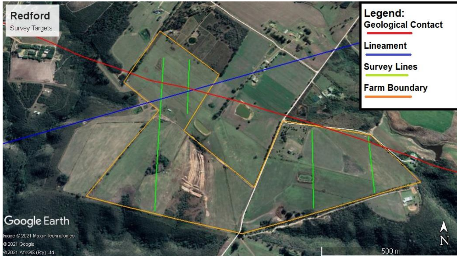
Figure 3. Proposed geophysical survey lines