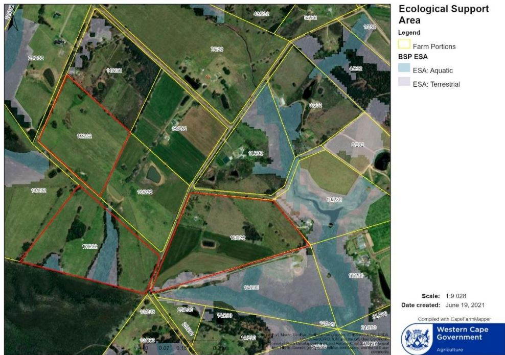
Biodiversity Overlay Map for Portions 17 of Redford farm no.232