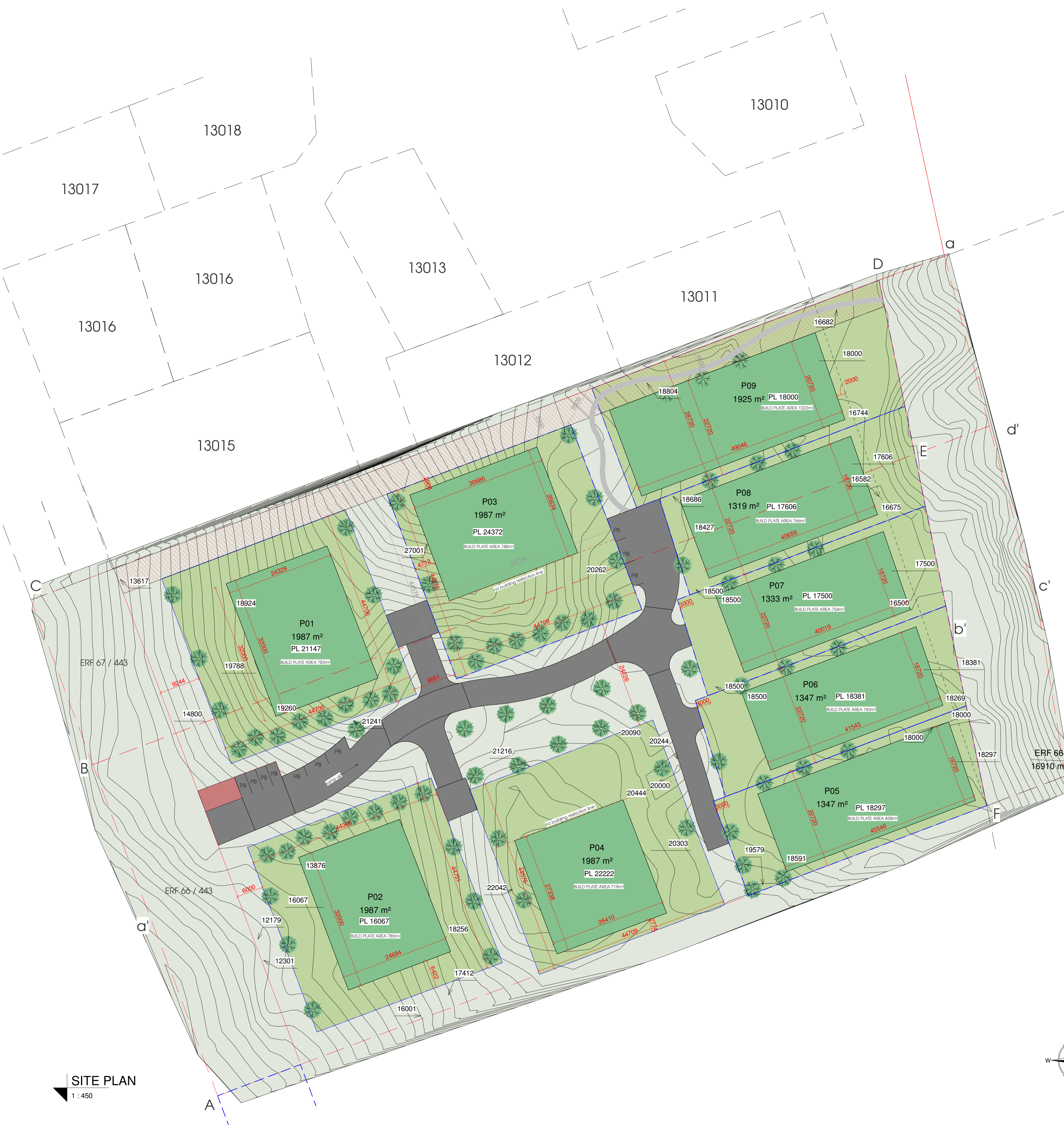
SITE PLAN 1 : 450