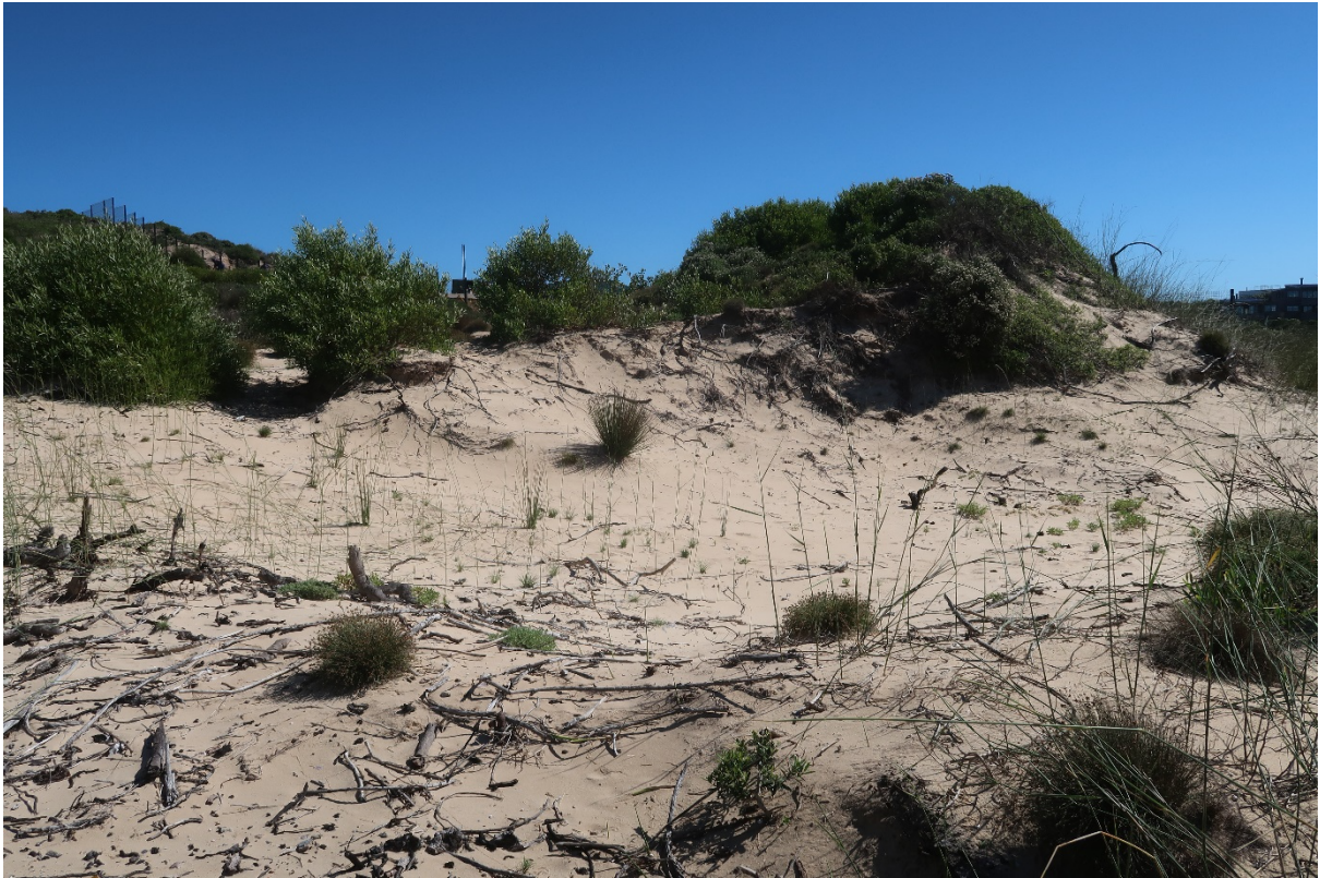
Figure 13: View north west from point 4 (Fig. 4) showing former sand mining area.