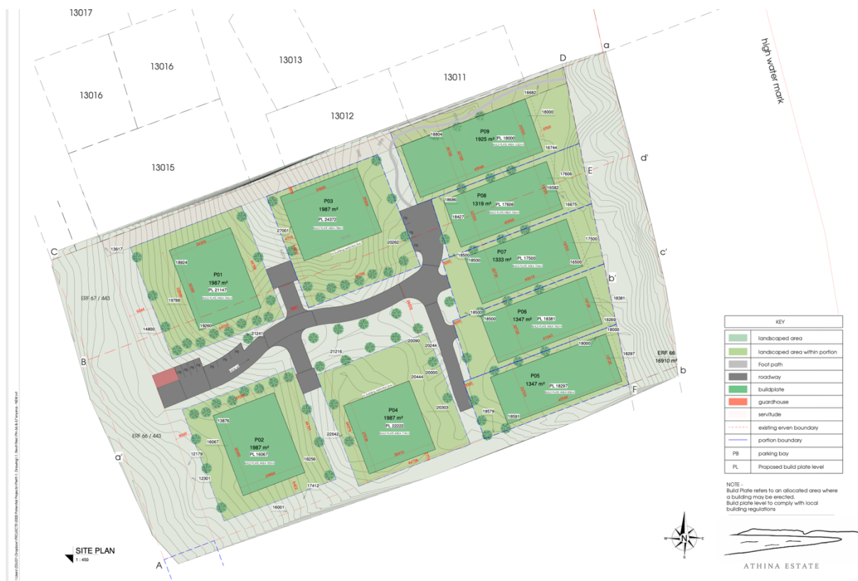
Figure 1: Proposed Development layout.