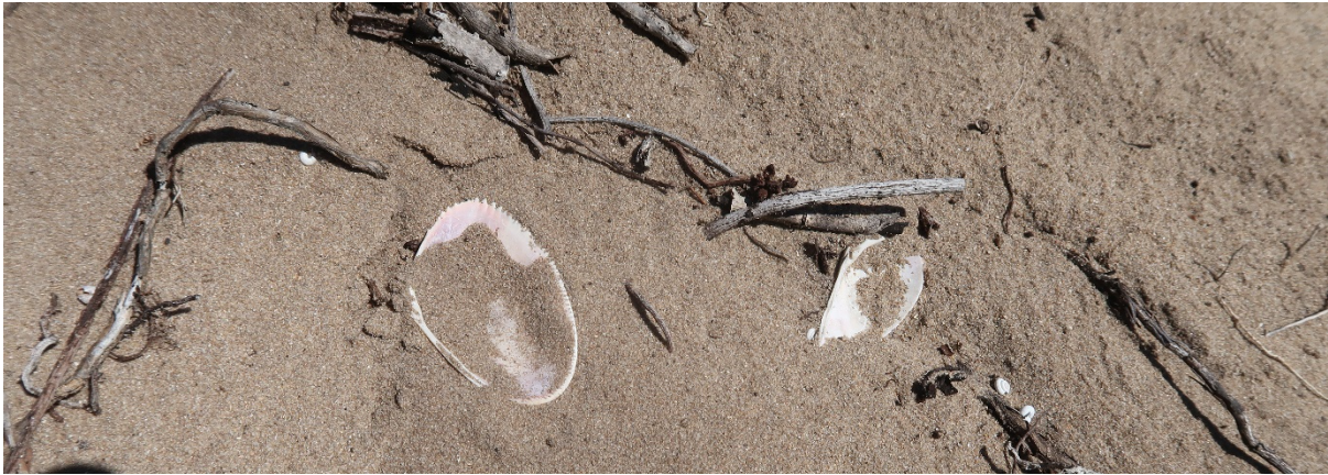
Figure 19: Part of a small concentration of sand mussels exposed at point 7 (Fig. 4).