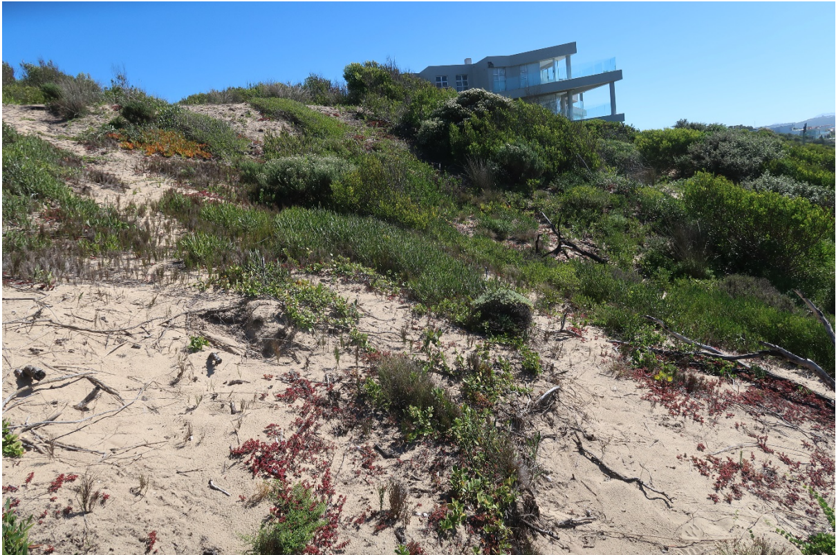
Figure 11: View north west from point 1 (Fig. 4) showing eroded dune front.