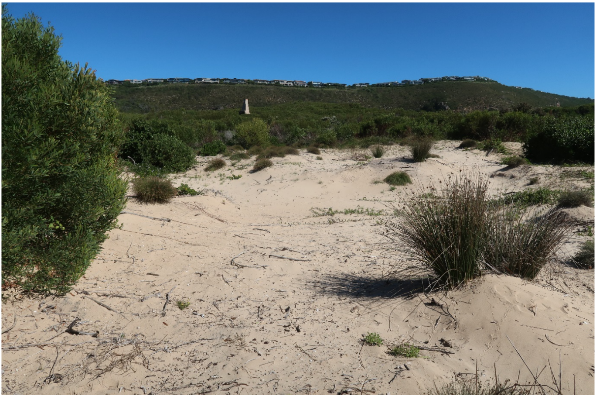
Figure 12: View south west from point 3 (Fig. 4) showing sand blowout resulting from previous construction activities.