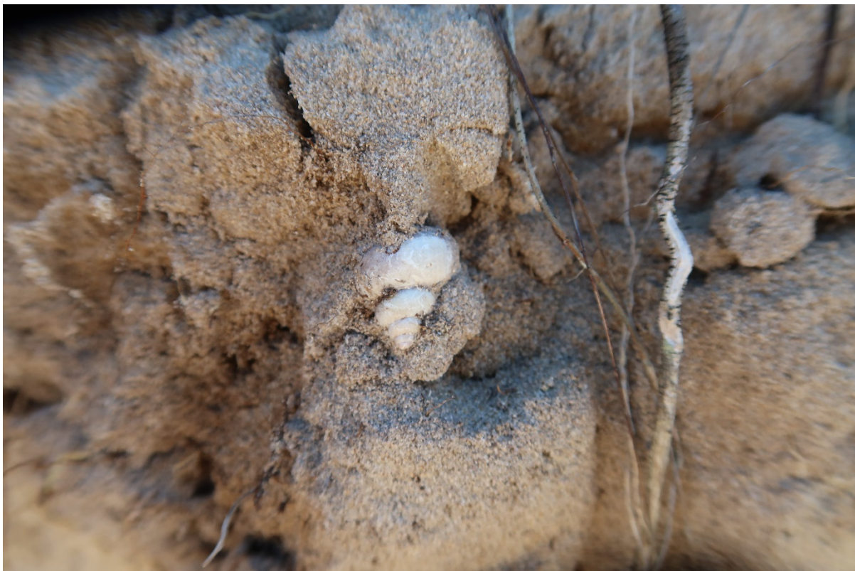
Figure 17: Terrestrial land snail shell in lightly consolidated sand at point 6 (Fig. 4).