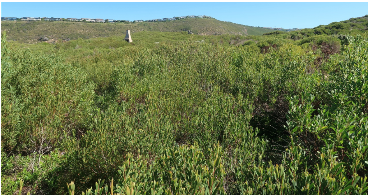
Figure 9: View south west from point 2 (Fig. 4) showing thick stands of Rooikrantz.