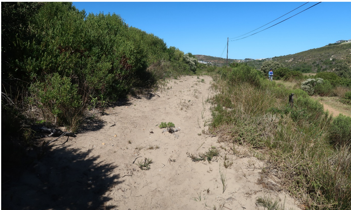
Figure 5: View southwards from point 9 (Fig. 4) along boundary of proposed development properties (situated to the left).