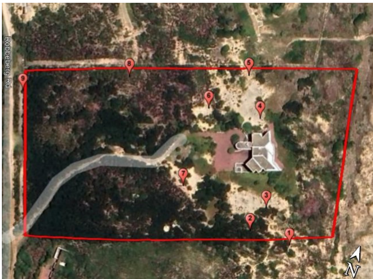
Figure 4: Satellite image of the study area with points where photos taken numbered.

Much of the eastern portion of the study area is covered in a mixture of low growing indigenous sand veld and invasive Rooikrantz (Fig. 3, dark green), presumably introduced into the area to stabilise the line of dunes. This vegetation currently hampers assessment of the palaeontological potential of the underlying sands (Figs 5-10).