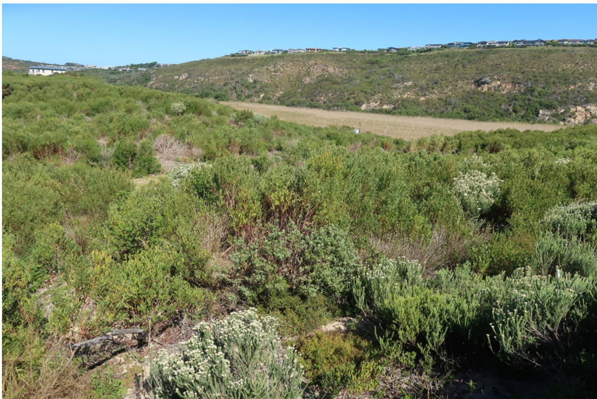
Figure 6: View south west from point 8 (Fig. 4) showing westerly portion of the intended development area. The property extends to approximately the overhead electrical lines and white electricity box (visible to right of centre). The wetland is visible below the properties with cliffs of Table Mountain Group, Peninsular Formation, sandstone beyond.