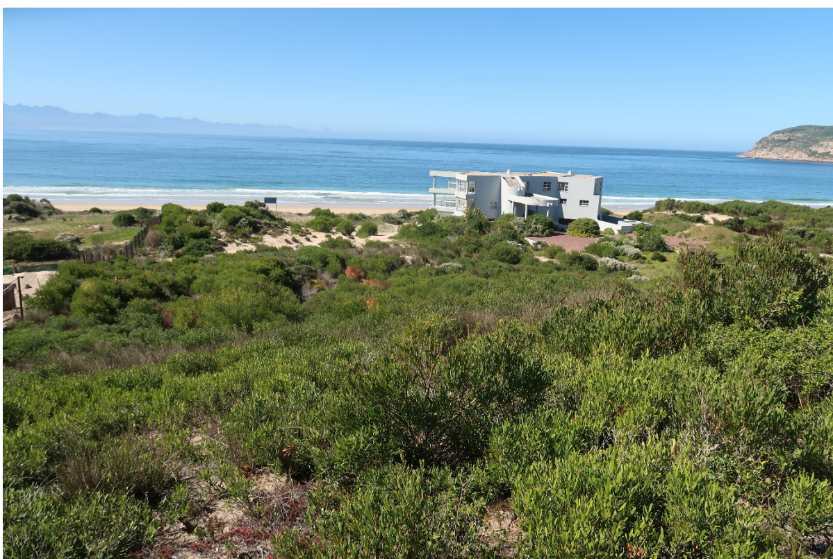
Figure 8: View east from point 8 (Fig. 4) showing the western portion of the proposed development area with the existing structure in the centre, and the northern boundary fence to left.