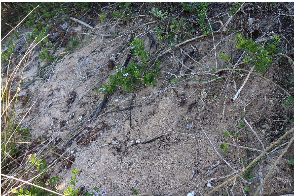
Figure 10: Fertile 'top sand' with a high organic content exposed near point 8 (Fig. 4).