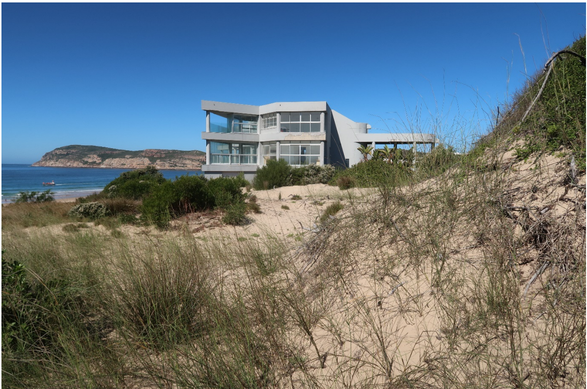
Figure 14: View south east from point 5 (Fig. 4).