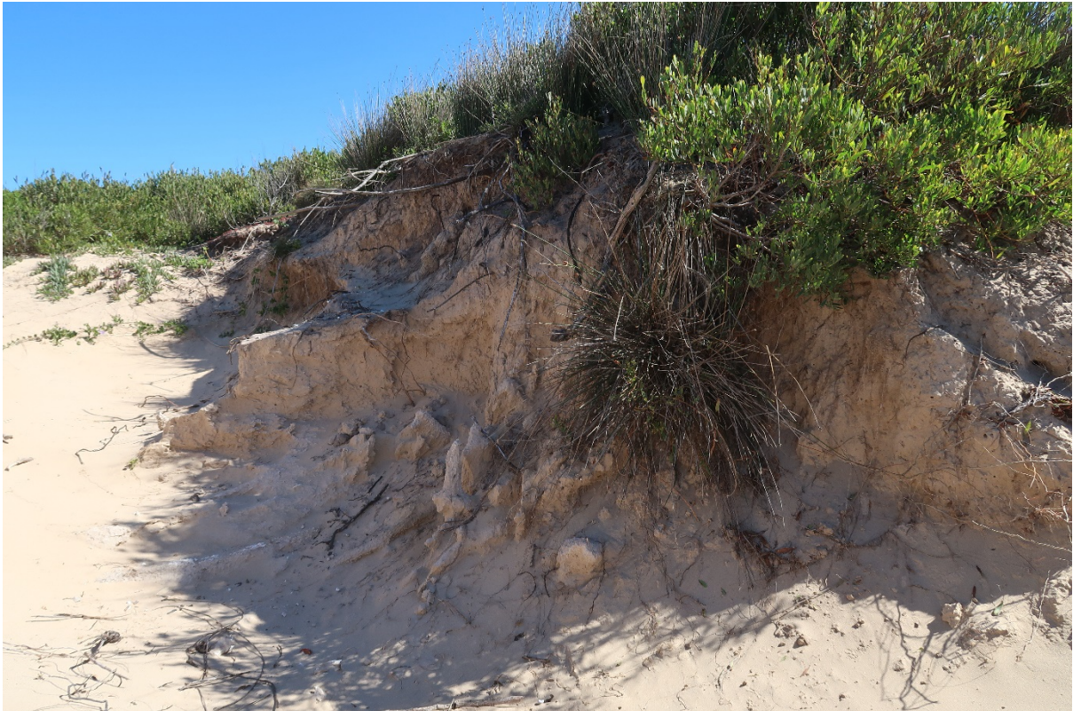
Figure 15: Weathered former face of sand extraction area at point 6 (Fig. 4).