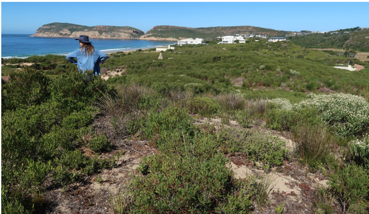
Figure 7: View south east from point 8 (Fig. 4) showing low growing indigenous strand veld in the foreground. (Robberg Peninsular in the background with pale cliffs of Table Mountain Group Peninsular Formation below and vegetated Cretaceous Enon-type conglomerates above).