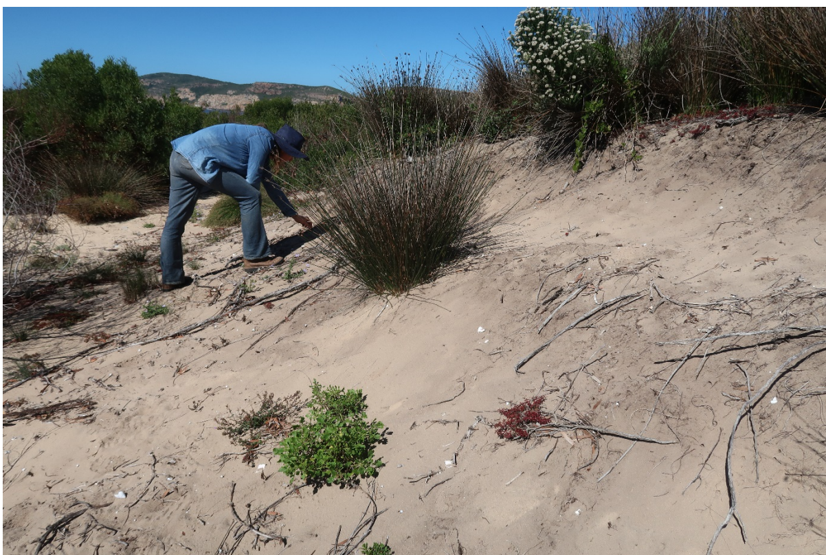
Figure 18: Area disturbed by sand mining at point 7 (Fig.4). looking to the south east.