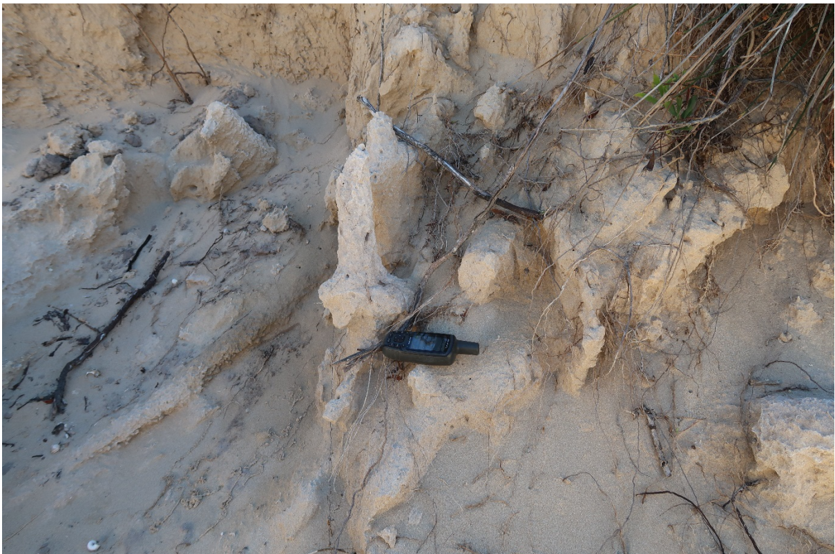
Figure 16: Rhizoliths (calcretised root casts) exposed in the bank at point 6 (Fig. 4).